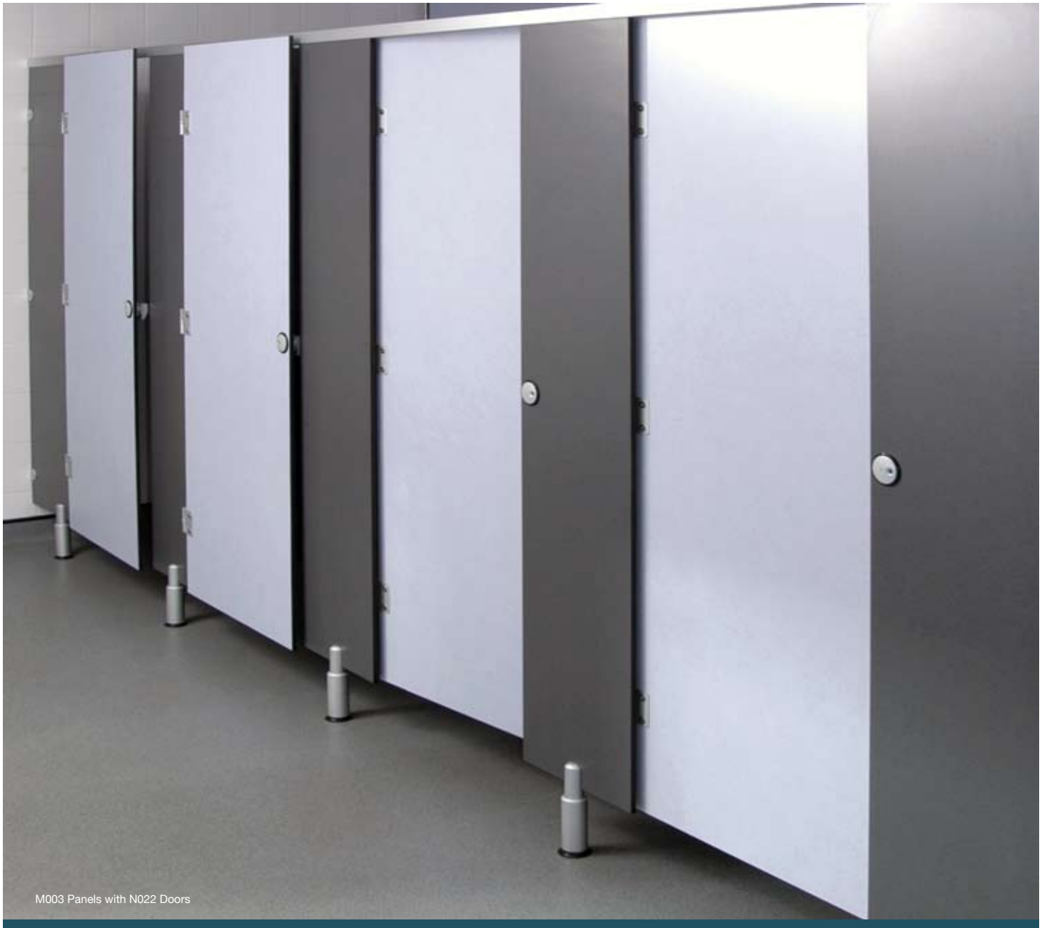
M003 Panels with N022 Doors