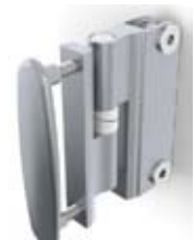
Hidden Safety Hinge