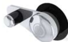
Robust 'Single Action' Latch