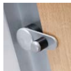
Robust 'Single Action' Latch