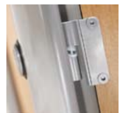
Hidden Safety Hinge