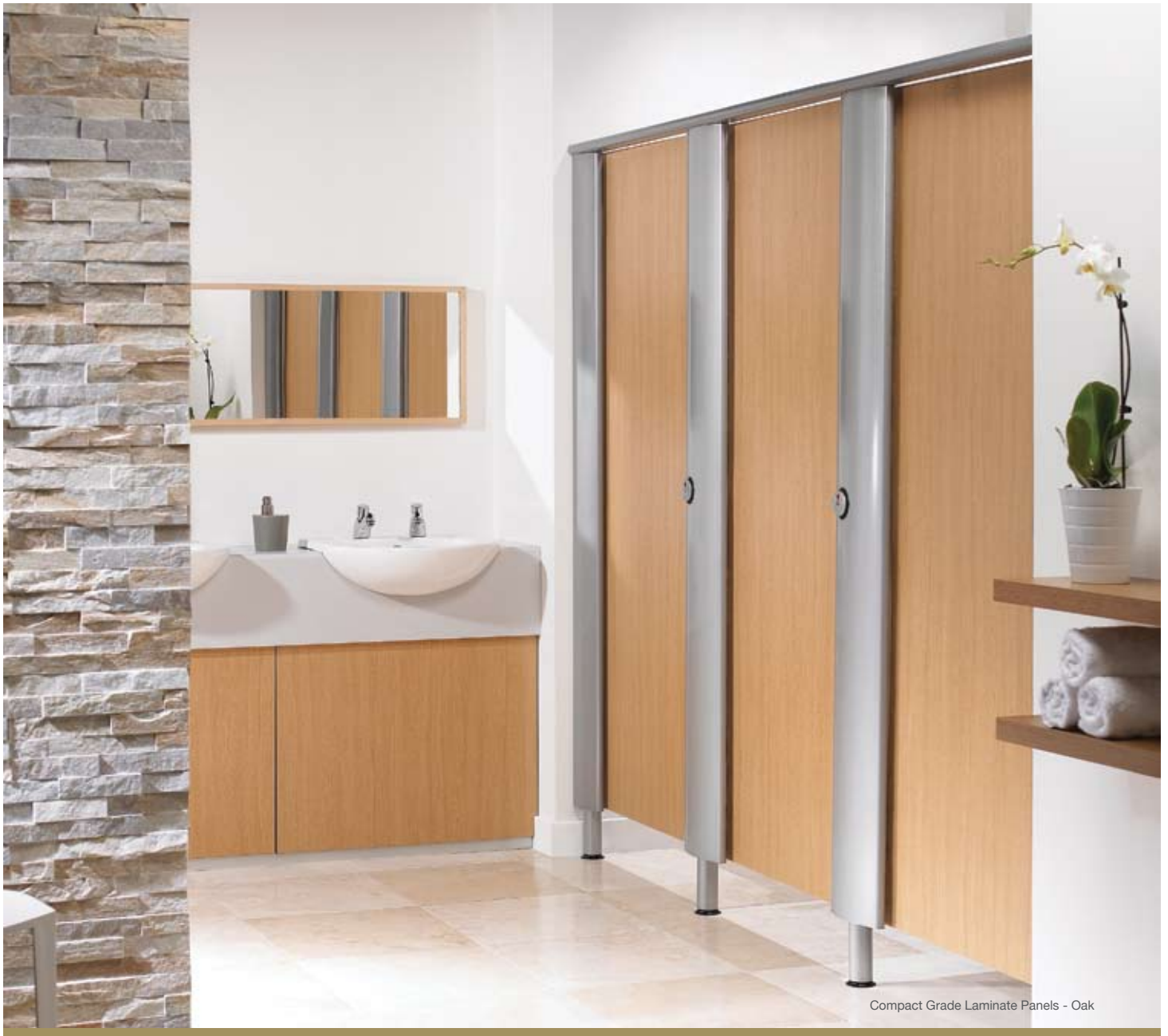
Compact Grade Laminate Panels - Oak