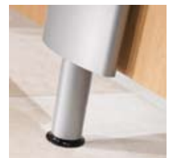
Wide Base Cubicle Leg