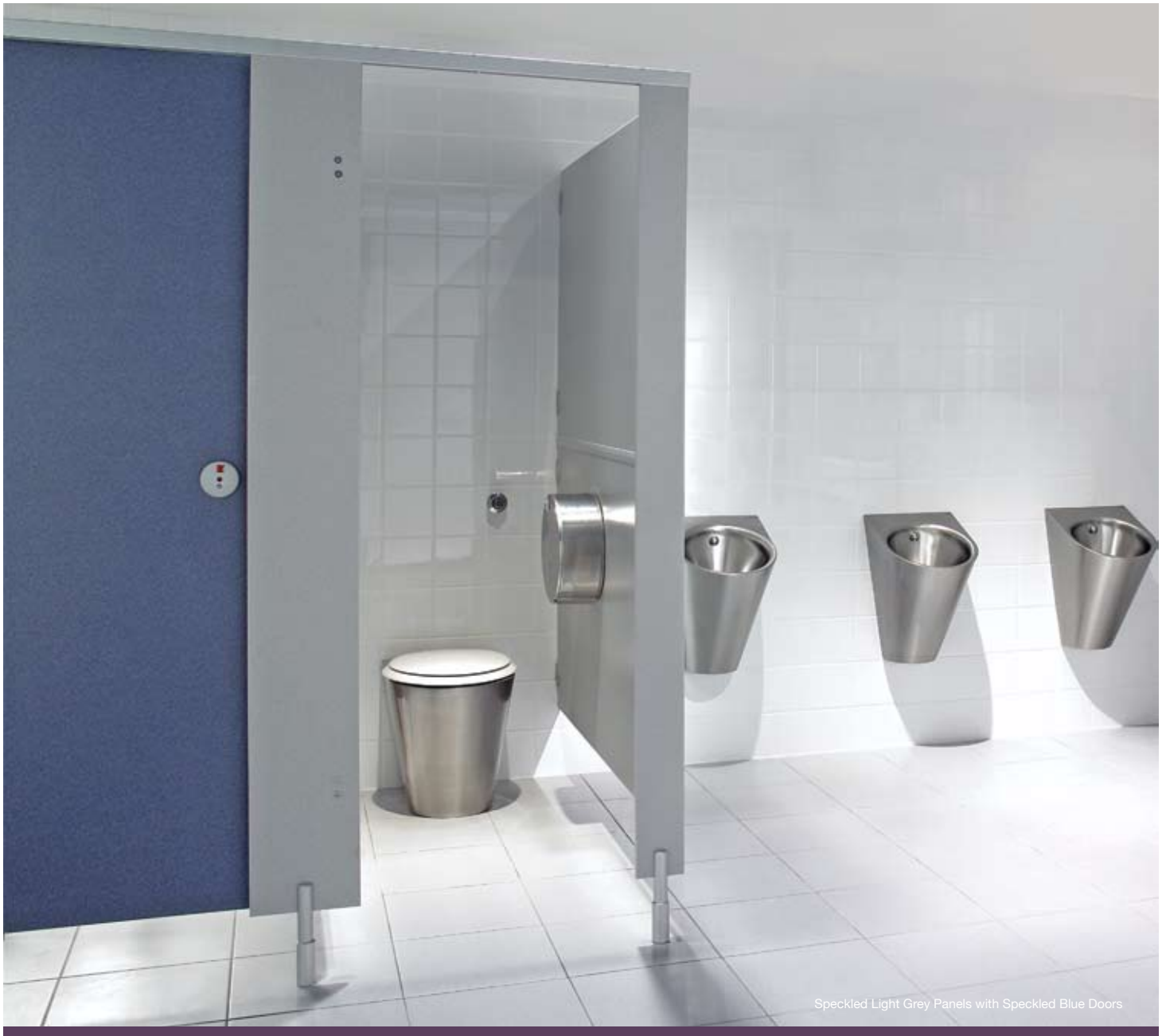
Speckled Light Grey Panels with Speckled Blue Doors