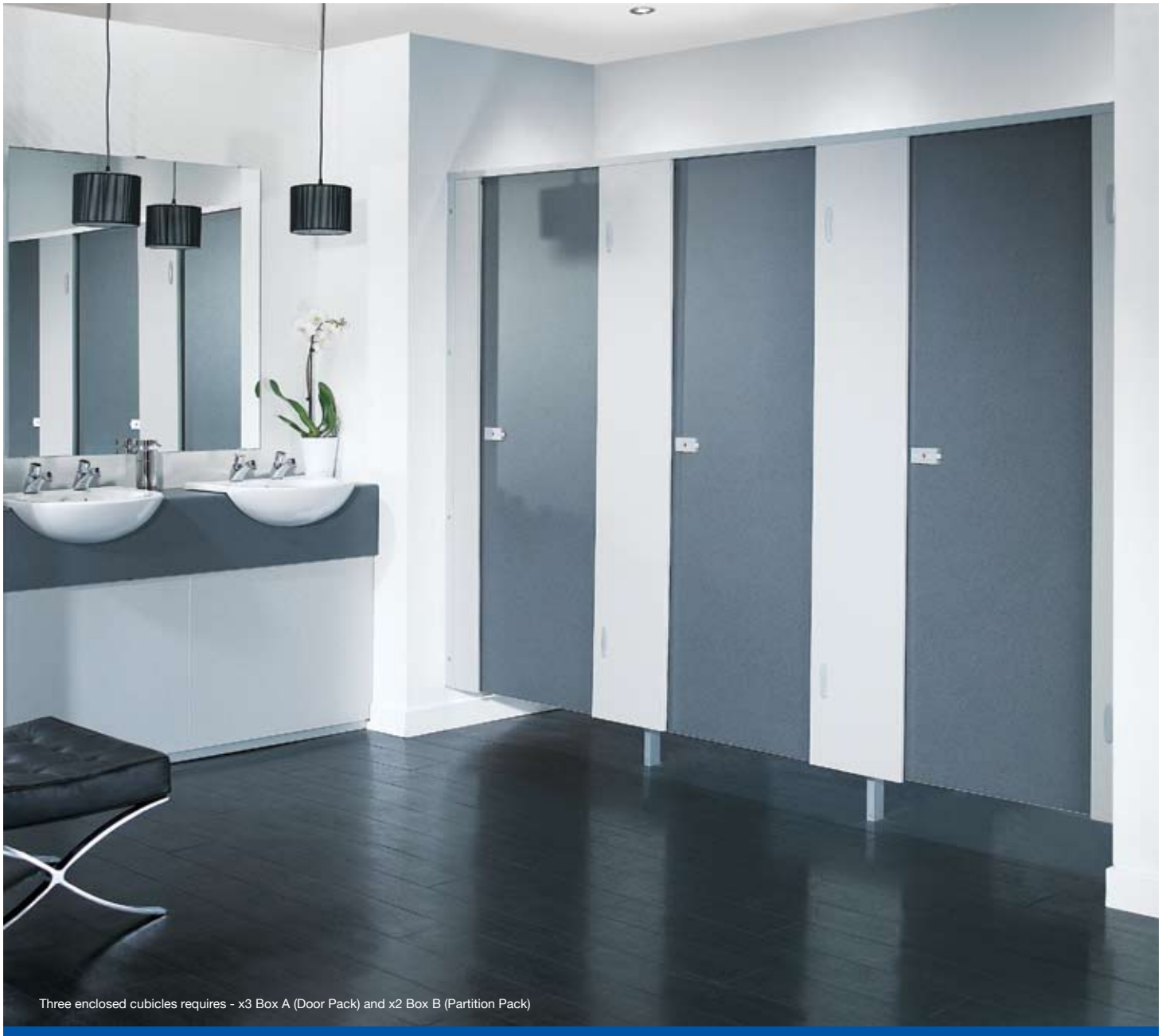
Three enclosed cubicles requires - x3 Box A (Door Pack) and x2 Box B (Partition Pack)