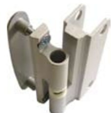
Hidden Safety Hinge