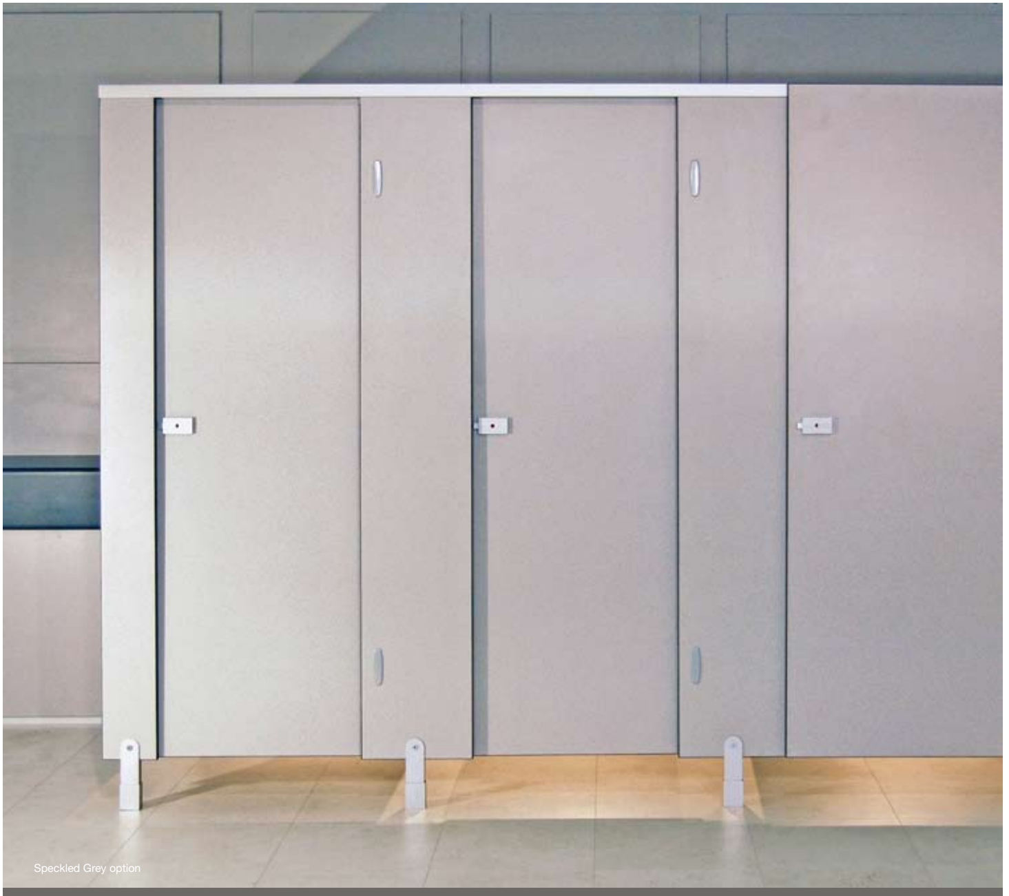
Speckled Grey option