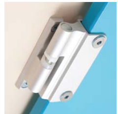
Hidden Safety Hinge