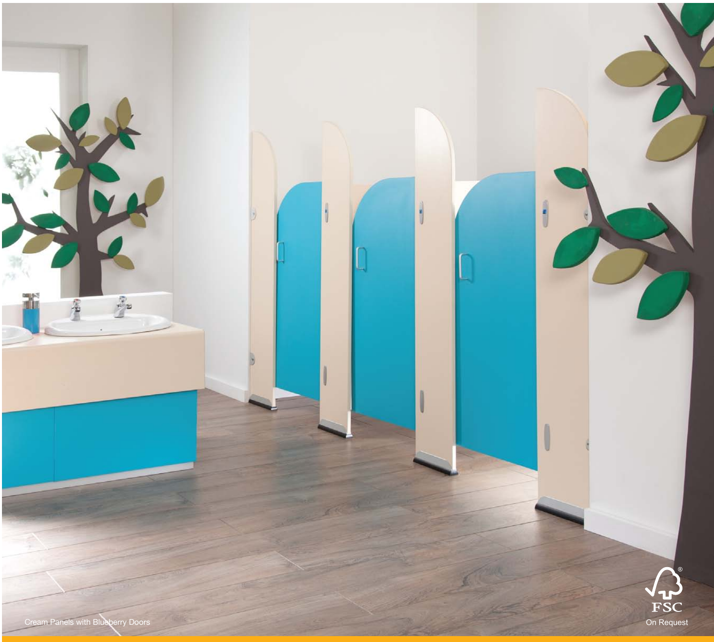
Cream Panels with Blueberry Doors