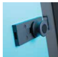
DDA Compliant Latch