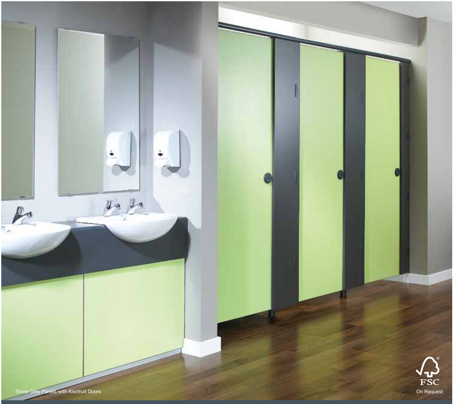
Stone Grey Panels with Kiwifruit Doors