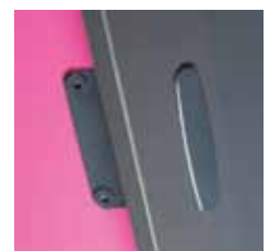
Hidden Safety Hinge